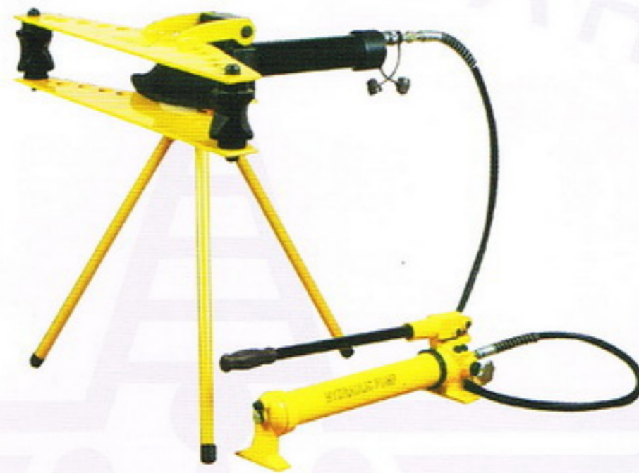
HHW - 2F F-SERIES