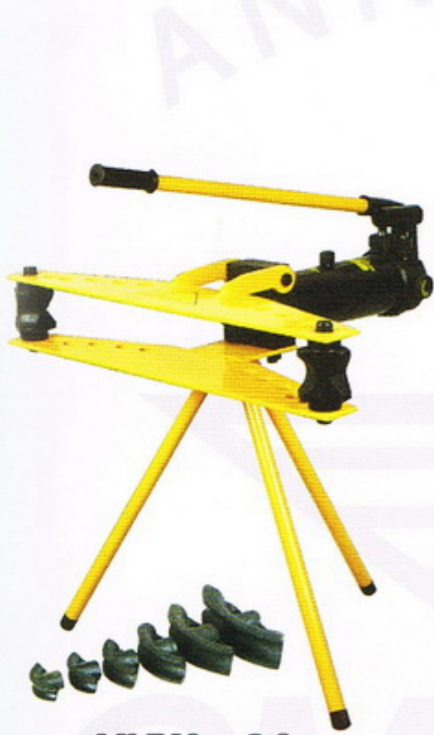
HHW - 2J J-SERIES