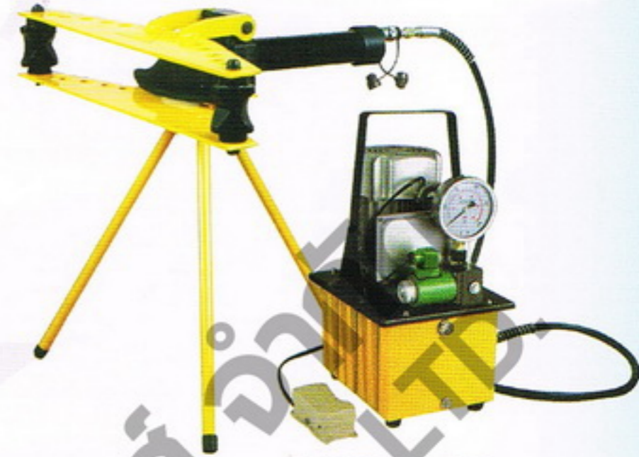
HHW - 2D D-SERIES