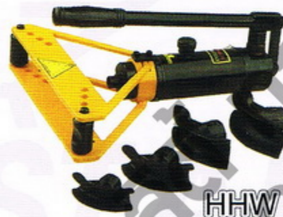
HHW - 1A